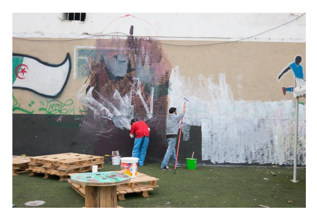
Figure 1 Culture innovators day, Algeria 2015

3.3.8. The British Council has been active in running internationally oriented development programs: Cultural Leadership (<a href="http://gulfartguide.com/british-council-mena-cultural-leadership-innovation-program-for-20122013/">http://gulfartguide.com/british-council-mena-cultural-leadership-innovation-program-for-20122013/</a>) and a program for Young Leaders (The Future leaders scheme). It currently offers positions for Future Leaders in the sector of cultural management under the framework of the Future Leaders Scheme 2015